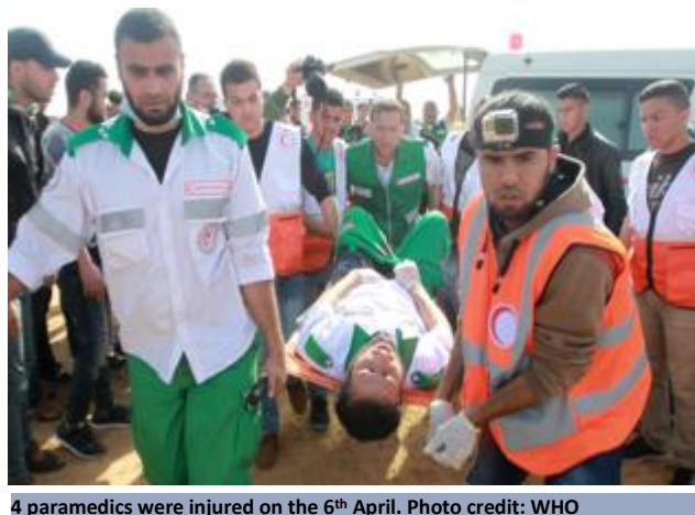
4 paramedics were injured on the 6 th April.