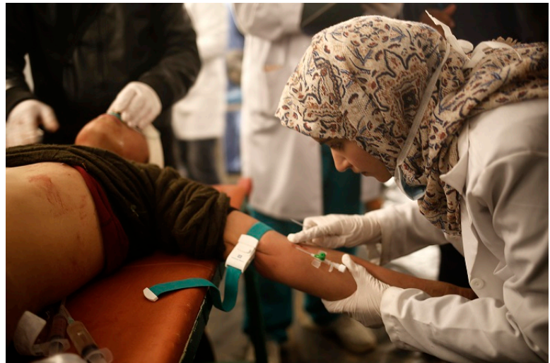
Injured patient receives pre-hospital care at the TSP.