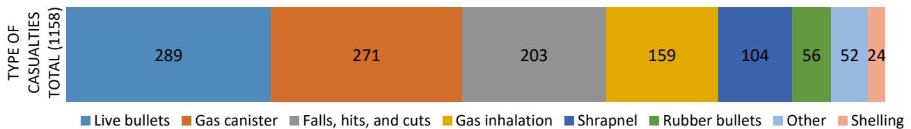
Figure 2: Emergency consultations at hospitals disaggregated by gender and age 01 to 31 March 2019