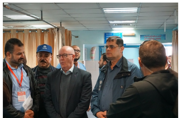
Humanitarian Coordinator field visit to Al Shifa Hospital