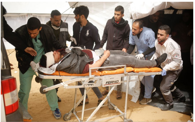
2,135 people were injured on 30 March.